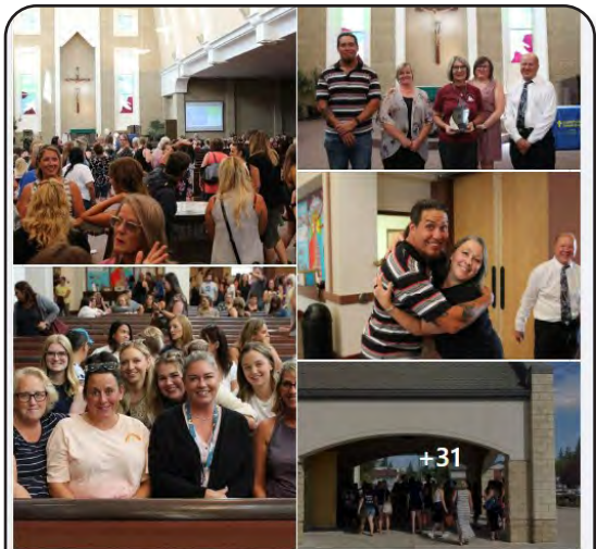
Grande Prairie & District Catholic Schools August 30 at 10:13 AM · 🌐 On August 26, over 700 staff from Grande Prairie & District Catholic Schools gathered to celebrate the opening ceremony and Mass at St. Joseph Catholic Church. Congratulations to all our service award recipients, Rotary Award recipients, Edwin Parr Nominee and Ambassador of Christ award winner!