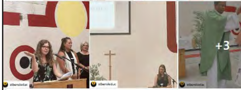
STAR Catholic School Division September 6 at 2:20 PM · Instagram · 🌐 #BelieveInCatholicEd 🇺🇸 @stbenseduc What a beautiful way to begin our school year. In prayer. 🙏🇺🇸 @starcatholic #blessed #schoolcommunity