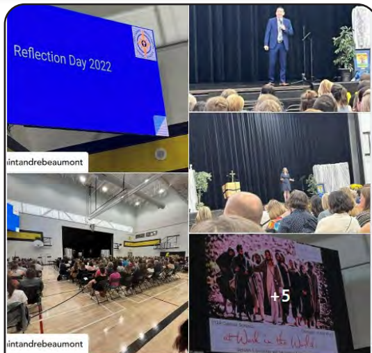
STAR Catholic School Division