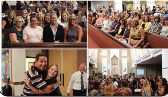
FMCSO @FMCSO · Aug 23

We are so excited for the first day of school tomorrow!