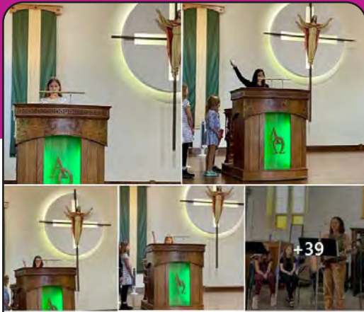
Bertha Kennedy Catholic School