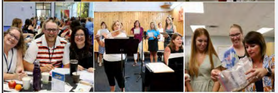
Lakeland Catholic School Division August 31 at 8:57 AM · 🌐 Yesterday, Lakeland Catholic welcomed staff back for the 2022-23 school year. #LCSJoy