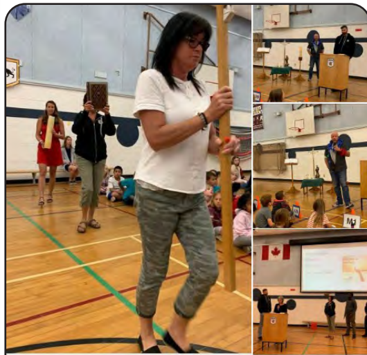
Ecole Father Jan