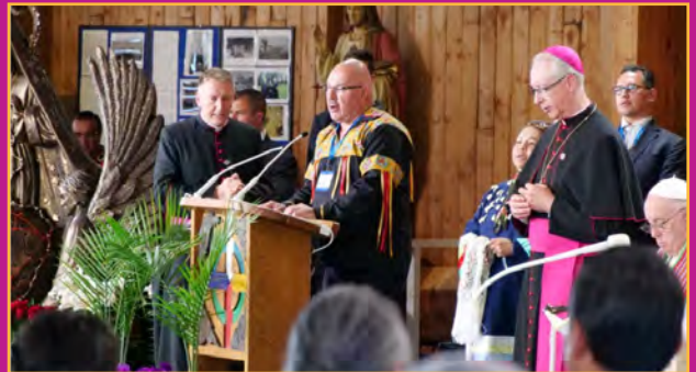
Pastoral Letter "That We May Walk Together" - ROMAN CATHOLIC DIOCESE OF CALGARY ( catholicyc.ca )